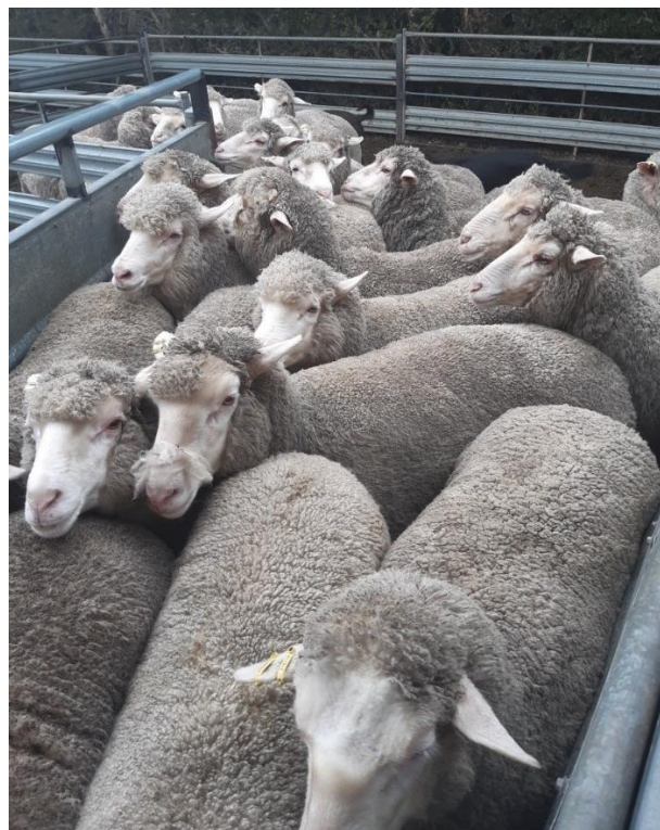
2021-Drop Hogget weighing. Photo courtesy of David Eckert, 26 th October 2022

Prior to shearing in late January/early February, adult mid-side samples and visual classing data will be collected as well as post shearing visual classing data and greasy fleece weight at shearing. The Eckert Family have kindly offered to yard the adult progeny in individual sire groups for viewing before they are shorn. Further details on the date of inspection will be provided later. Note this is purely an offer to view the progeny in the yards before they are shorn. Adult shearing and final off-shears adult weight of the ewes will mark the completion of the 2021 drop trial.