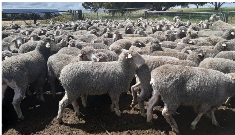
2021-Drop crutching.

The SA 2021 Drop Yearling Assessment Site Report is available on the Merino Superior Sires website: www.merinosuperiorsires.com.au