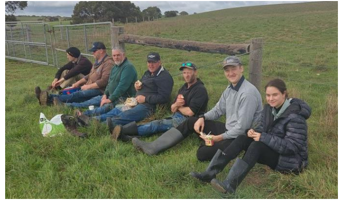
Left: Singles on a cold morning, 30 th May 2022. Right: Lamb marking crew 22 nd June 2022.

Pregnancy scanning by Cousins Merinos Services occurred on 21st February 2022 resulting in a 64% conception rate. Interestingly, 65% of the pregnant ewes were scanned as carrying multiple foetuses. Lambs were born 11 th -19 th May 2022. Lamb marking occurred on 21 st & 22 nd June 2022, giving a total of 825 lambs. Sire pedigree has been established by DNA testing, and we are waiting on some final DNA resamples collected recently before being able to share early data results. Following lamb marking, lambing mobs were boxed together to create one mob of singles, two mobs of twins and multiples. Lambs were weaned on 16 August 2022 with a weaning weight collected. Even up shearing of the lambs occurred on 17 October 2022 after many attempts were delayed due to rain.