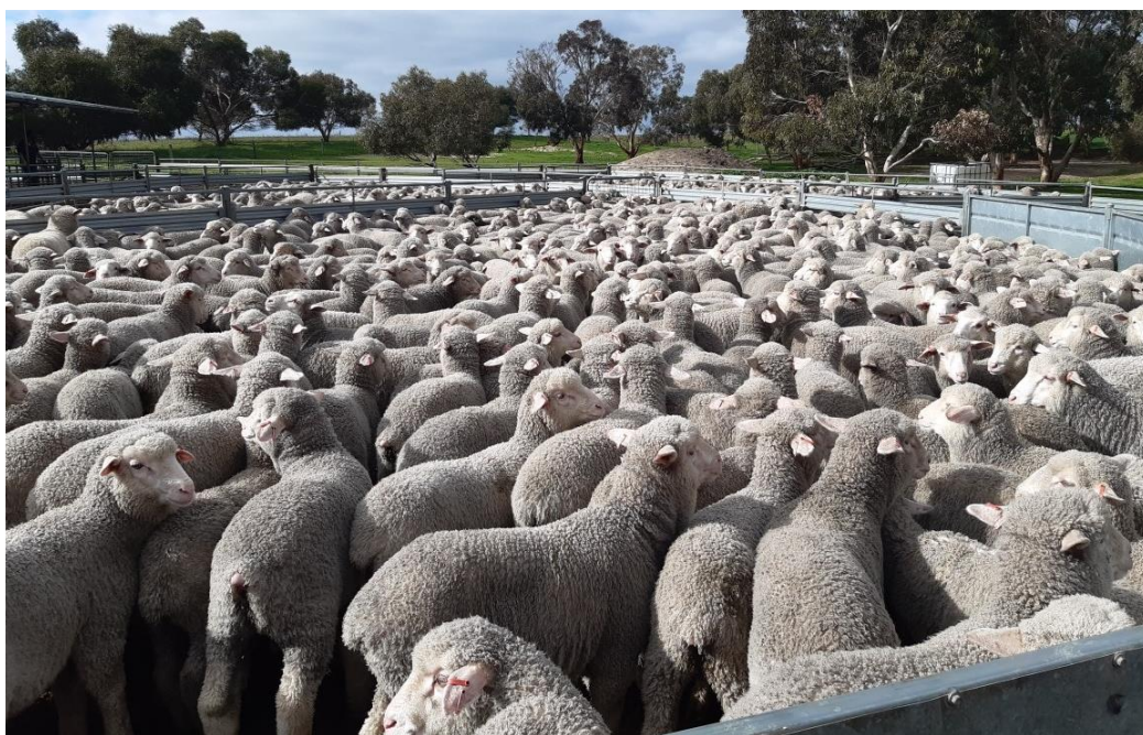
2022 Drop lambs at weaning. Photo courtesy of David Eckert, 17 th August 2022.

The 2022 drop progeny were drenched late October 2022 and returned to grazing on ample lucerne veldt grass based pasture.