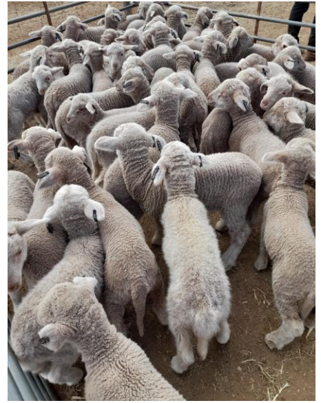
2024 Drop lambs at lamb marking.

In the lead up to lambing, ewes grazed natural pastures and were supplementary fed 30% peas and 70% barley at 250g/head/day. This amount per head per day was increased the closer it came to lambing. In addition, ewes were given oaten hay as required. This supplementary feeding has continued through to present, including through weaning, as the region copes with a very late late-June break, a cold early Winter, warm late Winter/early Autumn combined with well below average rainfall and very slow pasture growth as a result.