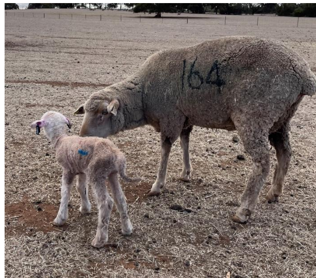
Conducting lambing rounds.

Pregnancy scanning by Cousins Merinos Services occurred on 29 th January 2024 resulting in a 64% conception rate. Ewes were separated into several lambing groups: singles 3 mobs of 55 ewes; twins 5 mobs of 33 ewes; triplets 1 mob of 38 ewes. Lambs were born 24 th April to 6 th May 2024, and thanks to the tireless work of the Turretfield Research Centre staff, lambing rounds were conducted daily allowing the collection of data (when there was no negative impact on bonding) including birth date, rear type, sex, birth weight and lamb mortality.