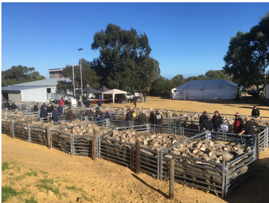
2022-Drop Field Day 23 rd June 2023.

The SA 2022 Drop Yearling and Adult Assessment Site Report is available on the Merino Superior Sires website: www.merinosuperiorsires.com.au